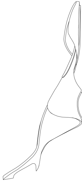
• typ. 80 •