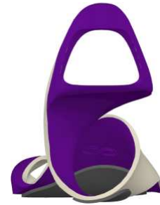
• typ. 95 •